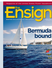
Ensign - Winter2016