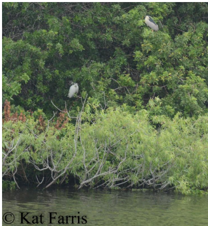
black crowned night heron pair

For as many times as we have been out to TM Goodwin, we've never encountered the number of alligators as we did that day. We saw over a hundred doing what alligators do in the various ponds we visited.