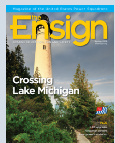
Ensign - Spring 2016