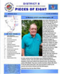
Pieces of Eight - Winter 2016